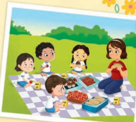
sit on a mat and share snacks