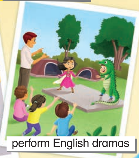
perform English dramas