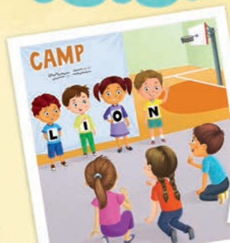
play games and learn English